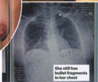
She still has bullet fragments in her chest

"The bullet hit my implant, which basically exploded and stopped it hitting any of my organs,"